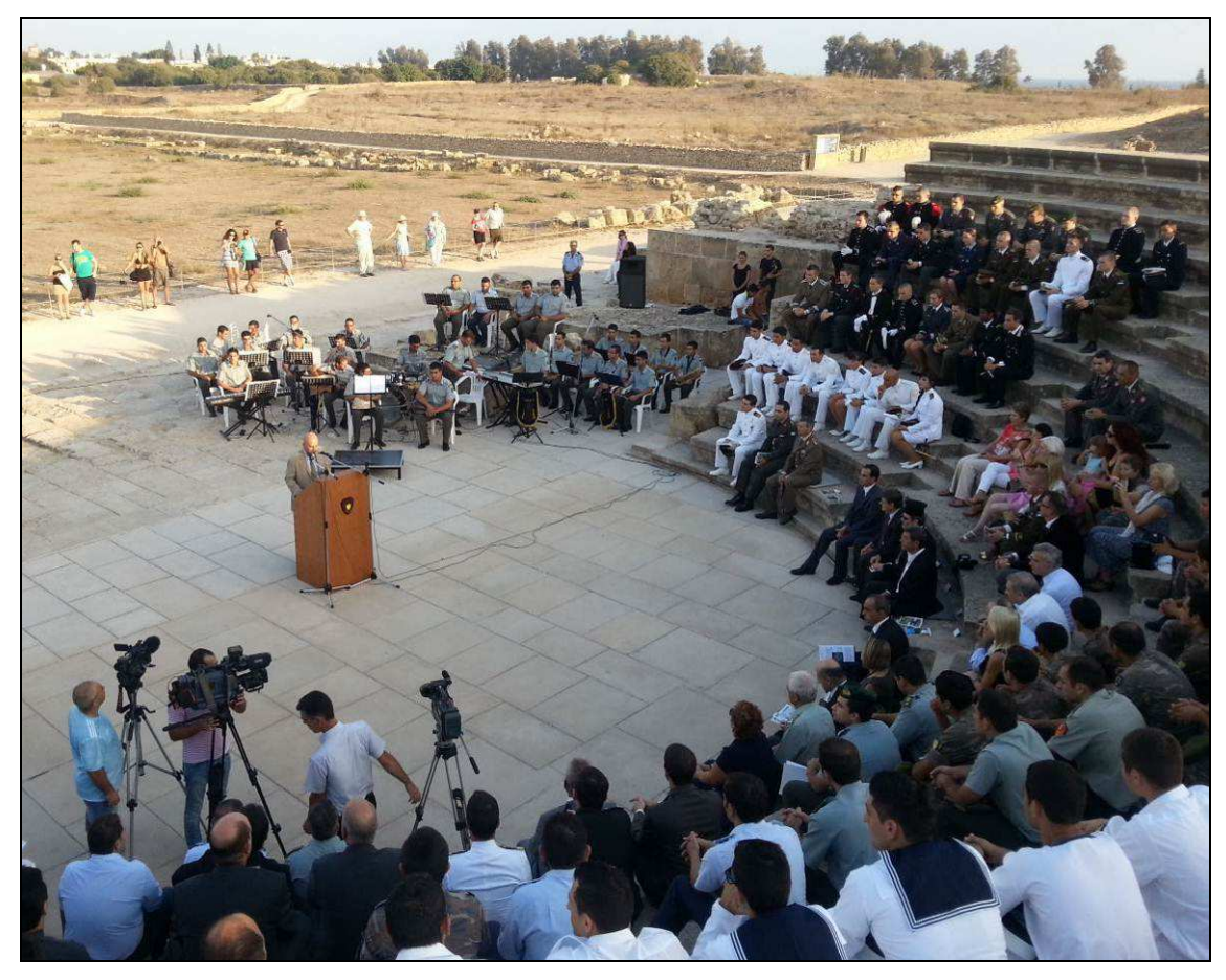
Opening ceremony of the CSDP-Olympiad in Paphos/Cyprus.

An impressive opening ceremony took place in the very nice and historical interesting Odeon in Paphos under the auspices of the Cypriot Minister of Defence, Demetris ELIADES. It gave a first impression on the great hospitality of Cyprus which lasted until departure.