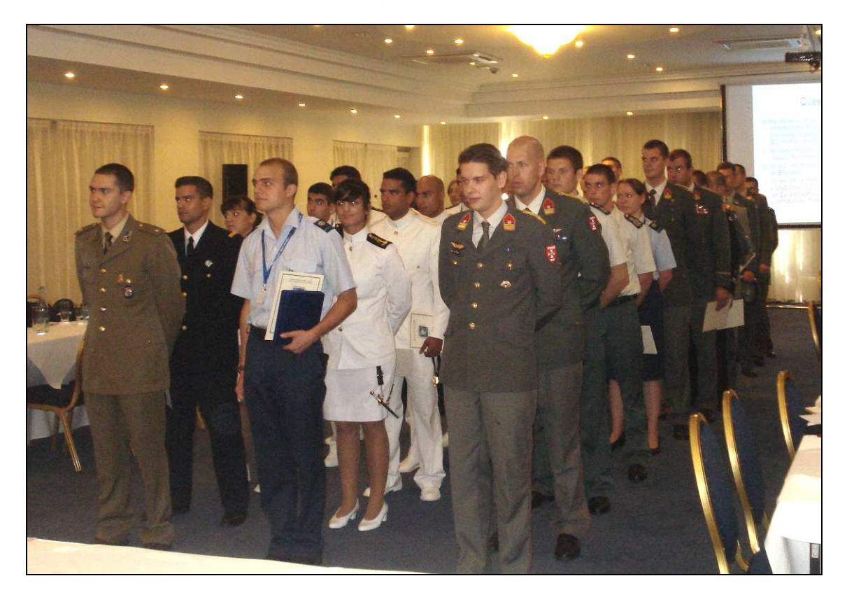
CSDP-Olympiad participants during the final ceremony.

The whole Olympiad ended with a farewell lunch and an exchange of information between the participants. Most of them profited from this friendly competition not only concerning an increase of knowledge but also in creating new friendships and networks.